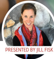
PRESENTED BY JILL FISK