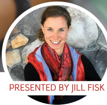
PRESENTED BY JILL FISK