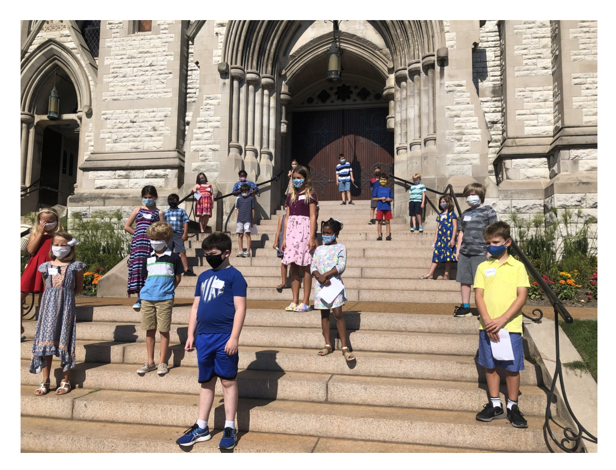
2020 First Communicants