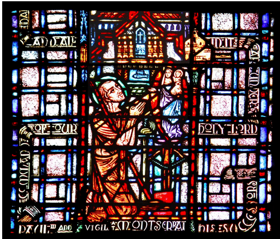
St. Ignatius of Loyola keeping vigil at Montserrat