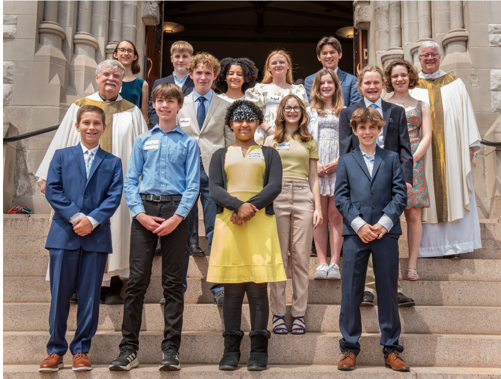
Confirmation 2023