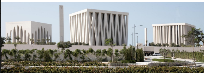
Abrahamic Family House: Mosque (left), Synagogue (center), Church (right).

comprises three buildings surrounding a large plaza, each similar in size but distinctly designed: a mosque, a church, and a synagogue. Together they are called the “Abrahamic Family House,” named after the Old Testament patriarch, Abraham, whom all three religions revere. The church is under Catholic sponsorship but open to all Christians.