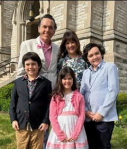
The Voss Family