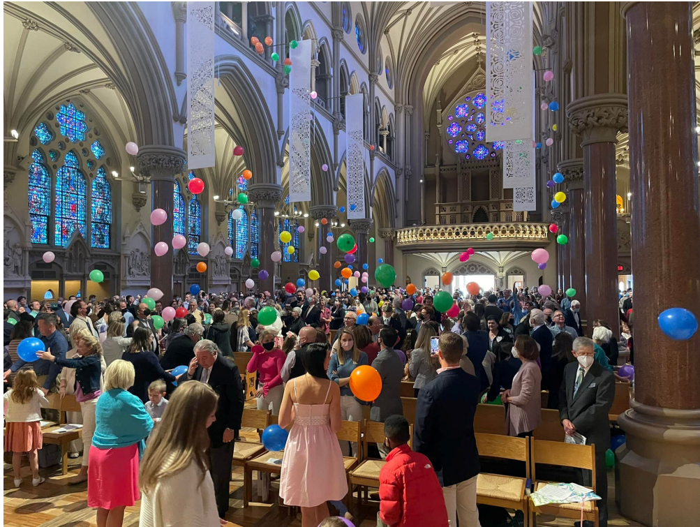
Easter Balloon Drop 2022