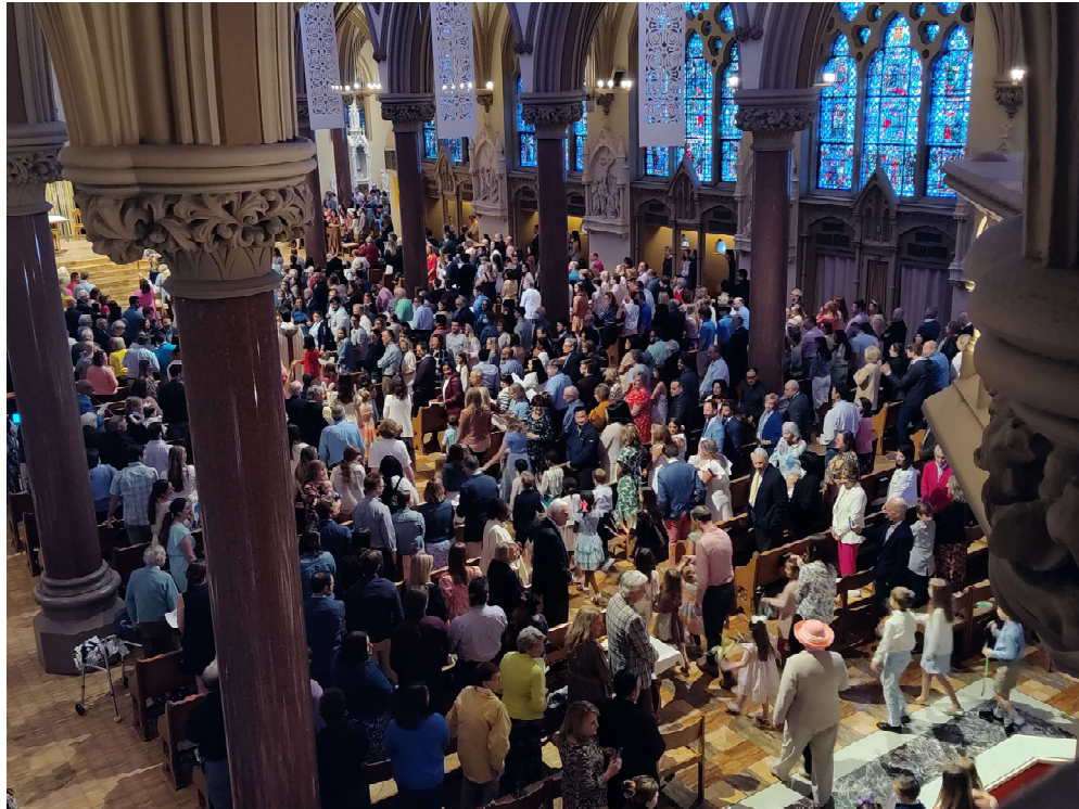
10:30 am Easter Sunday Procession