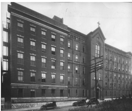
St. Mary's Infirmary, pictured above