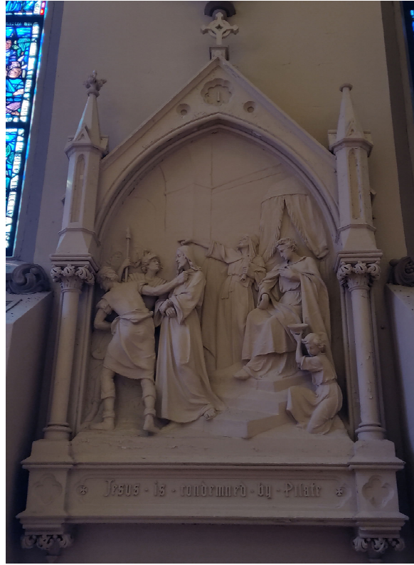
The First Station of the Cross: Jesus is Condemned by Pilate