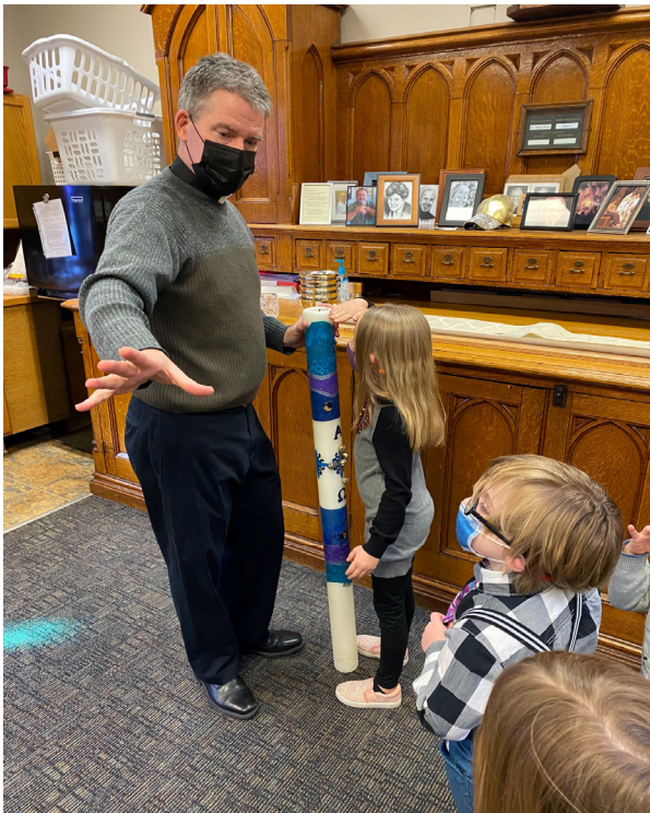
That Easter candle is as tall as they are!

In recent weeks, we have had children from our Youth Faith Formation Programs take tours of the church and sacristy. Here are photos from a February 13th sacristy tour with children from the Level I Atrium.