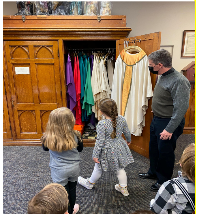
Atrium classrooms have beautiful, miniature versions of vestments and the children enjoyed seeing the actual garments.