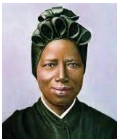
St. Josephine Bakhita

Bakhita was born around 1869, in Sudan in northeast Africa. At that time Sudan was a British colony bordered by the Red Sea to the east and Egypt to the north, so it was a significant economic player in the region. Accordingly, young Bakhita's family was