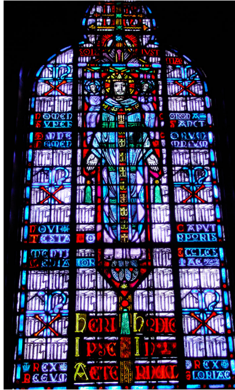
Christ the King Window