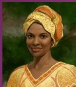
Servant of God Sister Thea Bowman