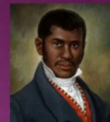
Venerable Pierre Toussaint