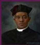
Venerable Fr. Augustus Tolton