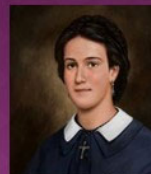
Venerable Henrietta Delille