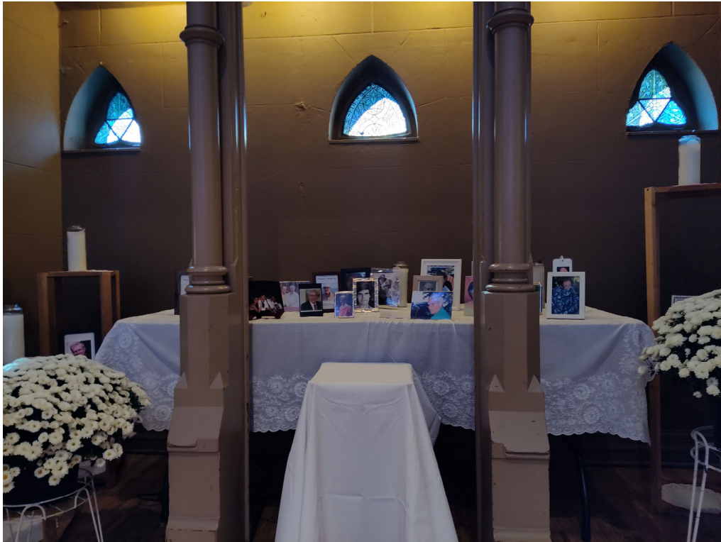
Shrine of Remembrance, 2023.