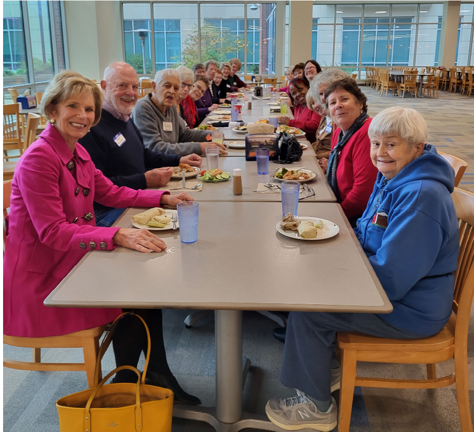
Attendees at Dining Out for Seniors at SLU's Grand Hall Sunday, October 29th