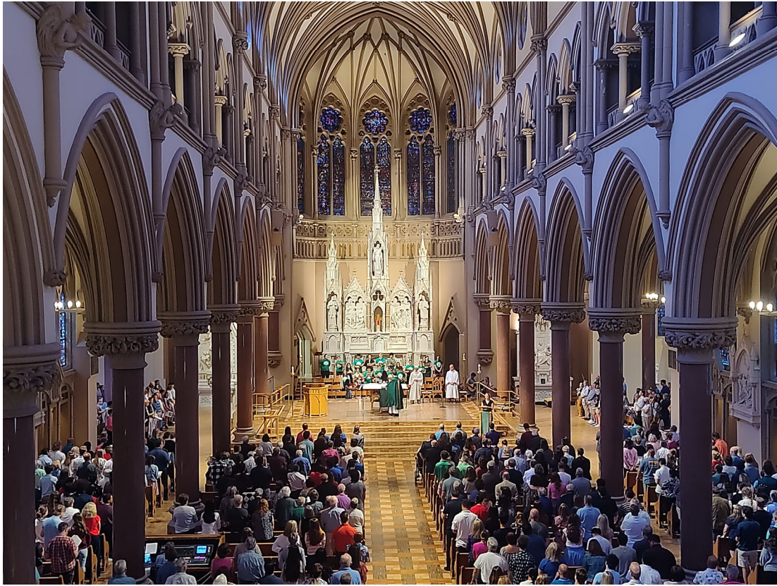
SLU Family and Alumni Weekend 2023