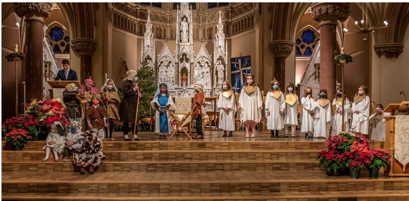
2021 Christmas Tableau