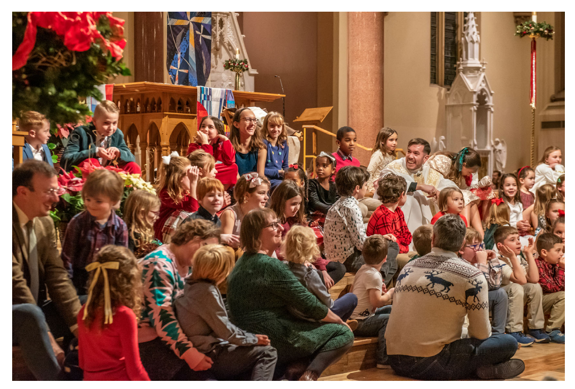
Family Mass 2023

St. Francis Xavier (College) Church The Jesuit Parish in the Heart of St. Louis 3628 Lindell Blvd, St. Louis, MO 63108 314-977-7300