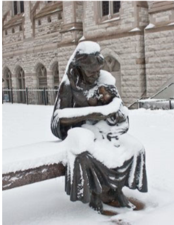
A previous year's snowfall at College Church