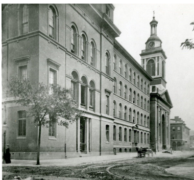
College Church at 9th & Washington

A subset of review team members formed a history committee to conduct the needed research and compile the historical data. It immediately became clear that, because of the age of our parish—nearly two hundred years old—its history is intimately interwoven with that of the City of