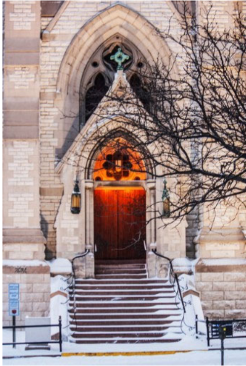
A previous year's snowfall at College Church